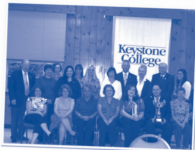
Members of the Finance and Administration Department accept the President's Cup Trophy as part of the 2009-2010 Annual Fund department wide challenge.