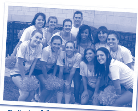
The Keystone College cheerleading squad cheered on Susan G. Komen Race for the Cure participants.

In addition to the walkers, the Keystone College cheerleaders were also on hand. The squad performed at a pep rally prior to the event and also along the race route.