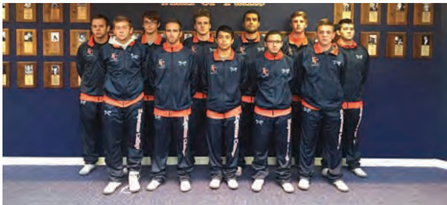
2016-2017 Keystone College Wrestling Team

A grand tradition has returned to Keystone College as wrestling has been reintroduced as a varsity sport following a hiatus of more than two decades.