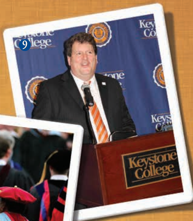
Photo Nine: Press conference accepting the appointment of tenth President of Keystone College, 2013.