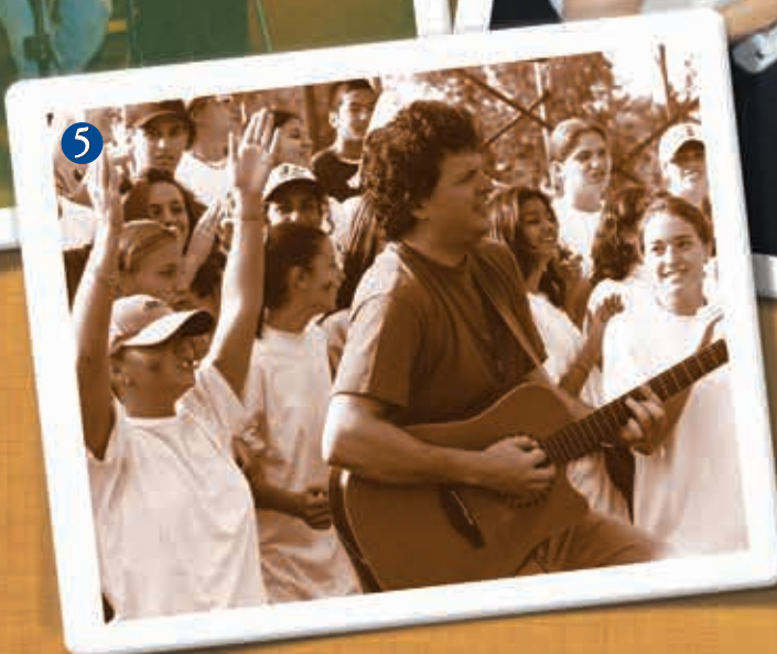
Photo Five: Leading songs at a high school youth festival in New Jersey.