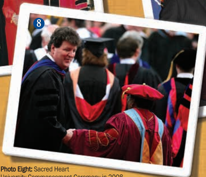
Photo Eight: Sacred Heart University Commencement Ceremony in 2008.