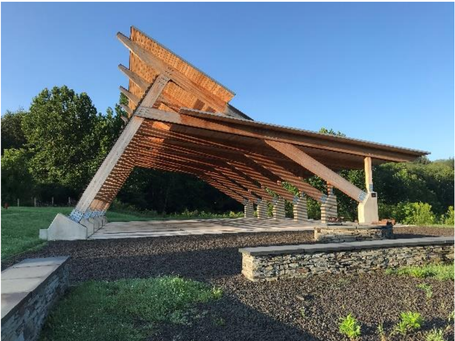
The Eckel Family Pavilion