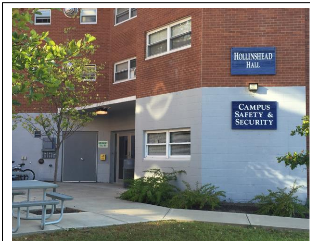
The Department of Campus Safety office is located on the ground floor of Hollinshead Hall (219 Regina Way).

The Department of Campus Safety operates twenty-four hours a day, seven days a week, 365